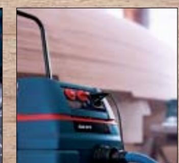
Jigsaw table MT300 WP: Suitable for all Bosch jigsaws. Both hands are free for the workpiece. Order no.: 0 603 037 103