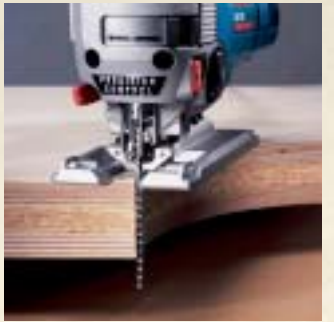
With Precision Control.