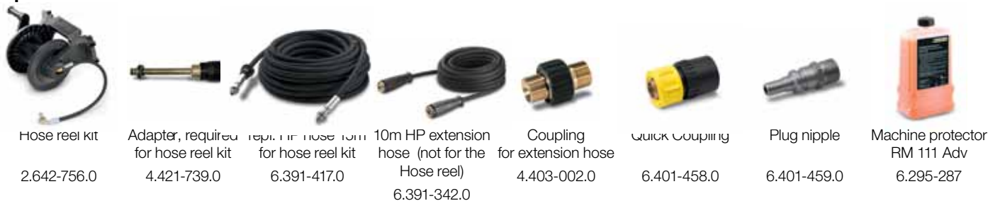
Hose reel kit 2.642-756.0