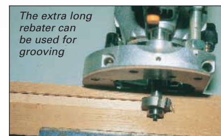
The extra long rebater can be used for grooving