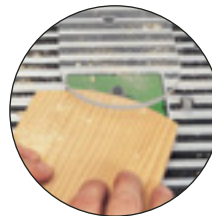
Profiling with Optional Top Guard

Rating _____ Craftsman Table top size (with extensions) 359 x 1030mm Table top size (without extensions) 359 x 605mm Bench height (without floor stand) 367mm Bench height (with floor stand) 1000mm Router cutter aperture 54mm Insert ring sizes 32mm, 48mm, 54mm Backfence height 100mm Dust spout aperture 57mmØ Edge planing up to 12.7mm Voltage 240v/115v 115v unit supplied with 16A BS4343 plug and socket.