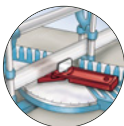
Position the long part parallel to the workpiece and set the sawblade parallel to the metal flag.