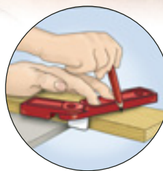
Can also be used for marking-out. Position the tool with the metal flag pointing downwards, parallel to the workpiece. Draw a line along the long part of the tool.