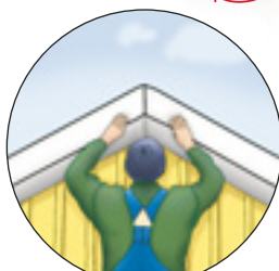
The result is a perfect fit.