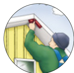
Position the tool in the unknown angle and the metal flag automatically halves the angle.