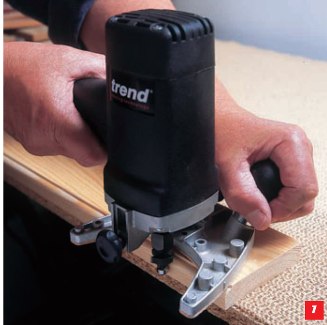
Moulding the edge of a board with bearing-guided round over cutter

Cutting curves - Since the T2 base has the standard EDT M6 threaded holes (with three M6 CSK machine screws provided as standard) I tried it with my home-made trammel bar to cut a curve in the top of a small board intended as a wall plaque. The trammel fitted straight on, but not at the