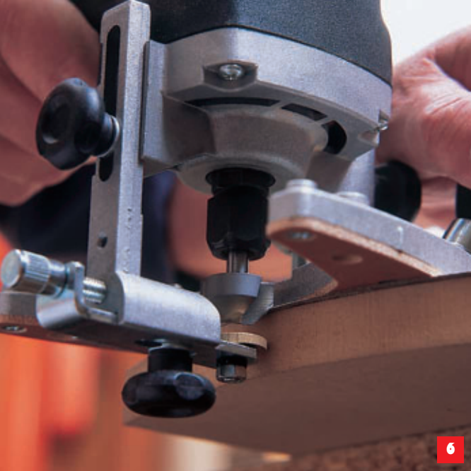
Plastic overhang on wall plaque being trimmed to 45° with combi-trimmer and roller copy follower

Photo 8 shows the work in progress with the T2 and a completed piece also in the picture. The nature of the exercise gave me a stable cut for the inside (clockwise) cut, but a very unstable one for part of the outer (anti-clockwise) cut, where very little base was running on the template. For serious work I would - as always - put packing pieces around the outside of