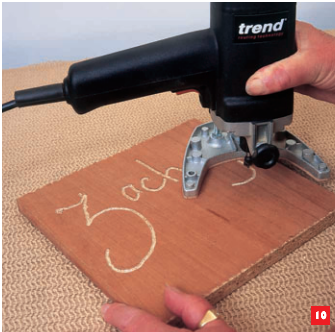
First shot at lettering with the T2, fitted with a V-grooving cutter

Photo 9 shows the curve being cut with a 1/4in straight cutter in the T2. For this picture the dust extractor was left on the machine. The connection to my extractor was via a stepped rubber adapter. This happens to be a Draper, but similar adapters are available from Trend. The plastic extractor spout has an