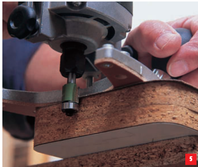
Router stand with laminate overhang being trimmed with bearing-guided flush trimmer fitted