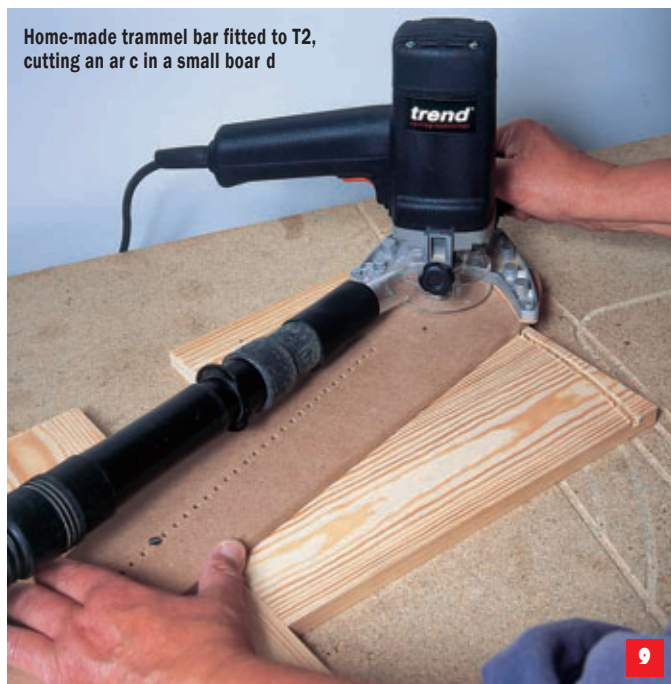
Home-made trammel bar fitted to T2, cutting an arc in a small board