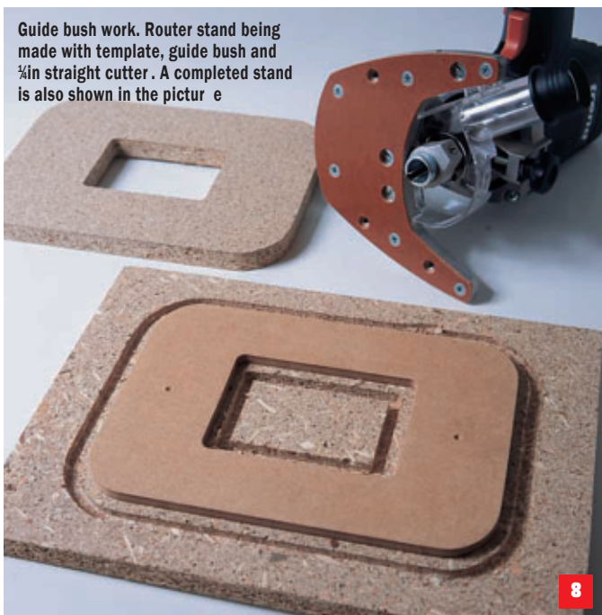
Guide bush work. Router stand being made with template, guide bush and 1/2in straight cutter. A completed stand is also shown in the picture

positions relative to the cutter axis as in the standard EDT router base.