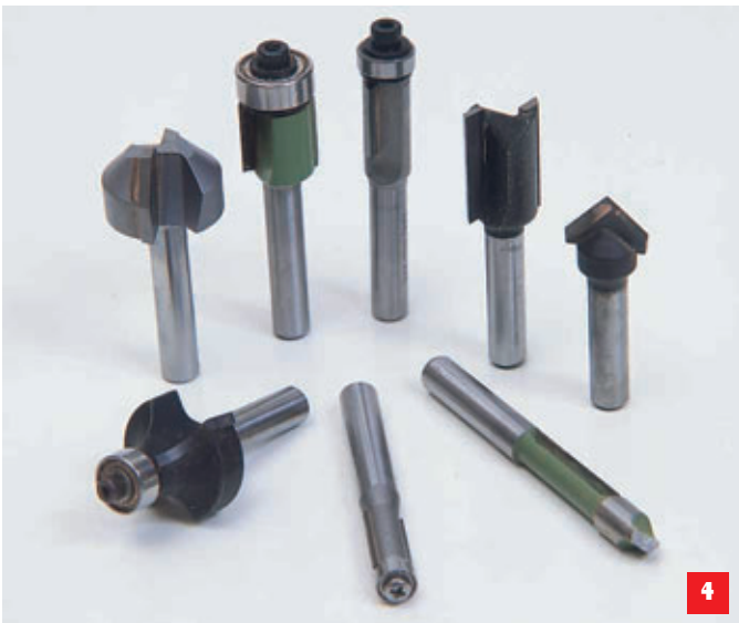
Selection of cutters suitable for use with the T2. Maximum diameter is 23mm

For the test, I cut several pieces of chipboard to make up a router stand, using a template made of 6mm MDF. The exercise took me back to my days with the old Black & Decker HD1250 non-plunging router. The technique is to set the depth of cut for a light pass, tilt the router back towards you, switch on and return the router to the vertical lowering the rotating cutter into the workpiece and bringing the guide bush against the edge of the template.