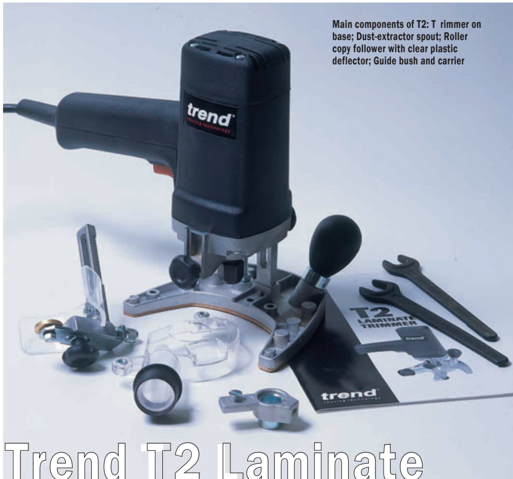
Main components of T2: T trimmer on base; Dust-extractor spout; Roller copy follower with clear plastic deflector; Guide bush and carrier