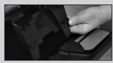
Locate the appropriate lugs into the slots provided on the inside edge of the reservoir.