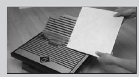
Place the tile against the angled table top.