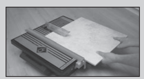
Maintain an even pressure, hold the tile against the cutting guide and push steadily through the cutting wheel. When the cut is complete, switch off the machine.