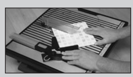
Switch on the machine and while holding the tile firmly in position, push the mitre guide steadily along the rip guide, feeding the tile through the cutting wheel. When the cut is complete, switch off the machine.