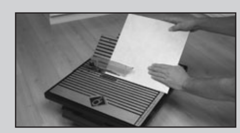
Switch on the machine and feed the tile through the cutting wheel. When the cut is complete, switch off the machine.