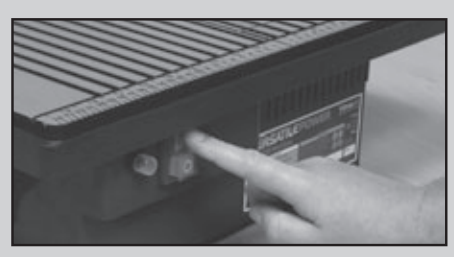
Switch on the machine.