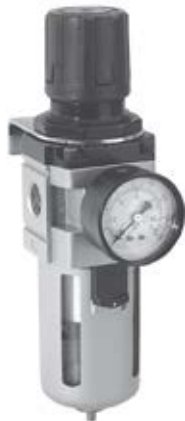
SA206FR & SA206FRAD