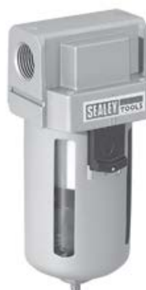
SA206F & SA206FAD