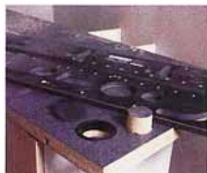
A cable tidy cut out using the jig