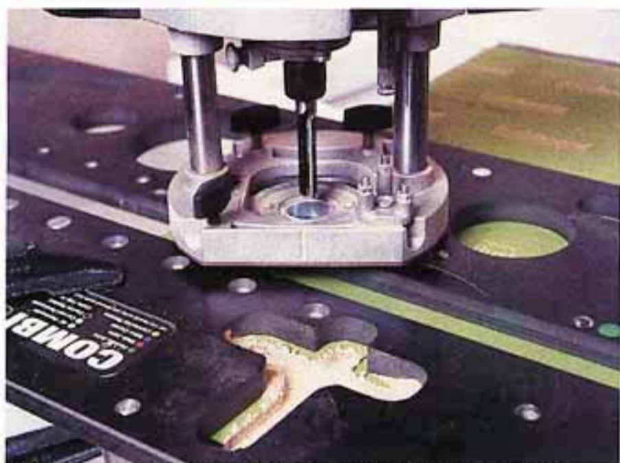
A worktop joining bolt recess, cut 20mm deep so that the bolts are in the centre of the worktop for maximum strength

Here is a list of all the functions it can perform: male cut, female cut, connector bolt recess, curved peninsular, 45 degree end cut, corner radius, 22.5 degree mitre joint, recesses for three types of cable tidy and finally recess for 35mm circular hinge. So that should satisfy the most ambitious kitchen fitter. R