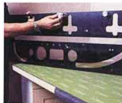
The yellow coded holes are used to align the jig with the joint edge

This is an impressive jig that covers just about every joint that you will need. It is robustly made, well finished and straightforward to use. If you fit a lot of worktops, this is the jig you need. A video manual is also available so you can see the jig in action.